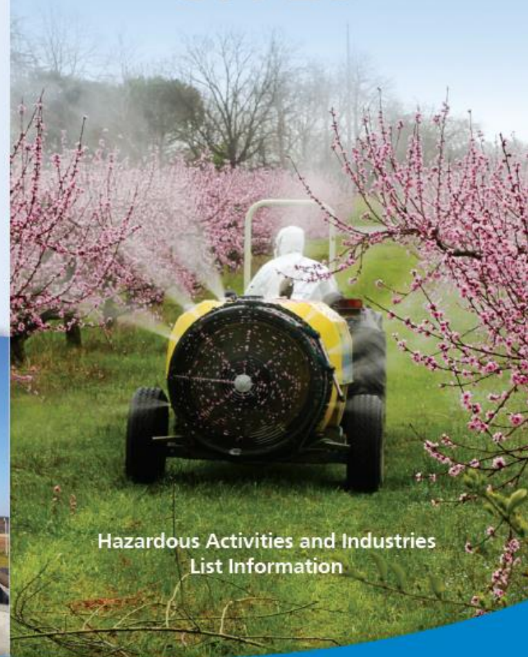
Hazardous Activities and Industries List Information