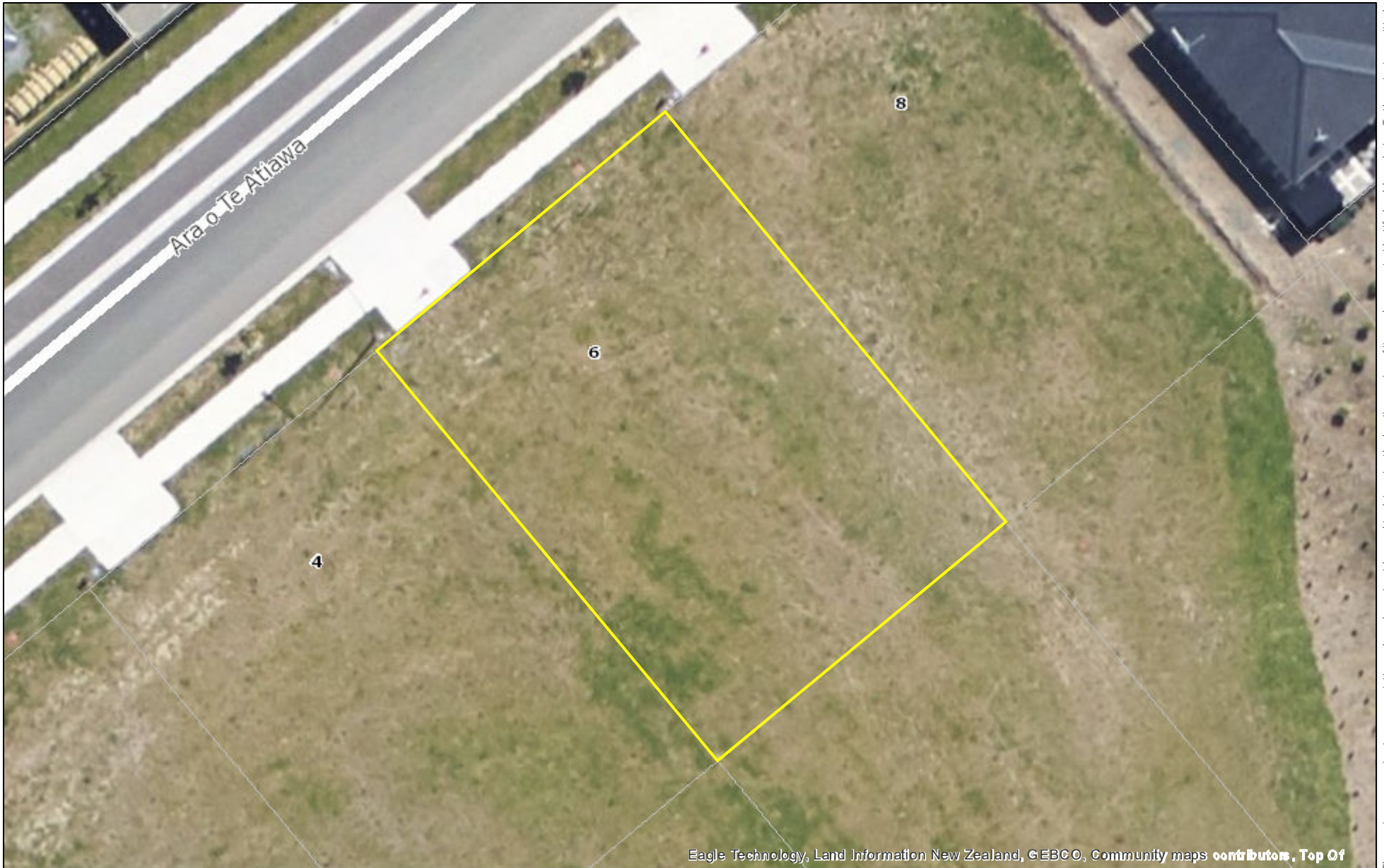
Eagle Technology, Land Information New Zealand, GEBCO, Community maps contributors, Top Of

The map is an approximate representation only and must not be used to determine the location or size of items shown, or to identify legal boundaries. To the extent permitted by law, the Tasman District Council and Nelson City Council, their employees, agents and contractors will not be liable for any costs, damages or loss suffered as a result of the data or plan, and no warranty or representation of any kind is given as to the accuracy or completeness of the information represented. Top of the South Maps information is licensed under a Creative Commons Attribution 3.0 New Zealand License, and the use of any data or plan or any information downloaded must be in accordance with the terms of that licence. Cadastrial and NZTopo50 related data is sourced from Land Information New Zealand