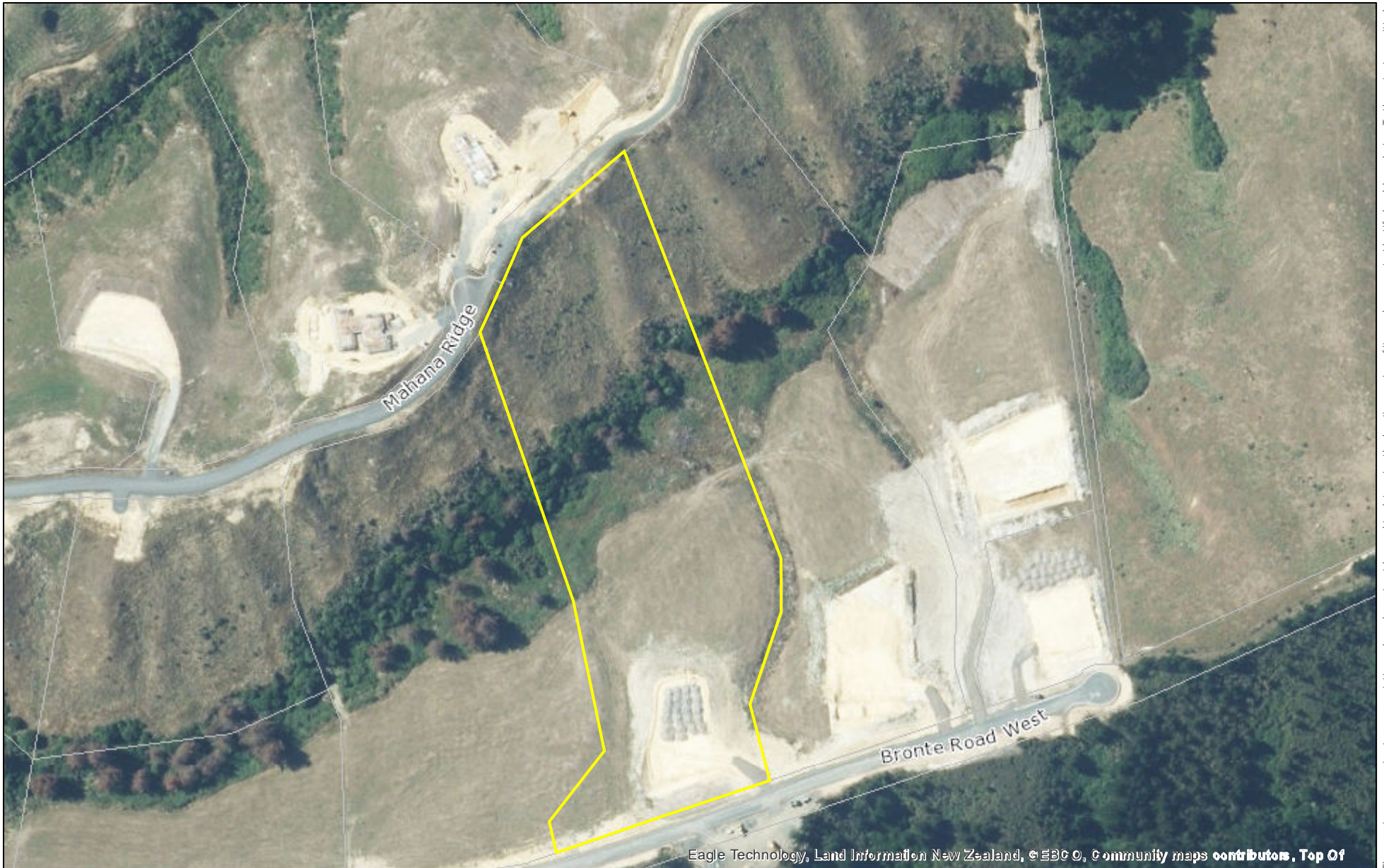
Eagle Technology, Land Information New Zealand, ©EEBC ©, Community maps contributors, Top Of

The map is an approximate representation only and must not be used to determine the location or size of items shown, or to identify legal boundaries. To the extent permitted by law, the Tasman District Council and Nelson City Council, their employees, agents and contractors will not be liable for any costs, damages or loss suffered as a result of the data or plan, and no warranty or representation of any kind is given as to the accuracy or completeness of the information represented. Top of the South Maps information is licensed under a Creative Commons Attribution 3.0 New Zealand License, and the use of any data or plan or any information downloaded must be in accordance with the terms of that licence. Cadastral and NZTopo50 related data is sourced from Land Information New Zealand