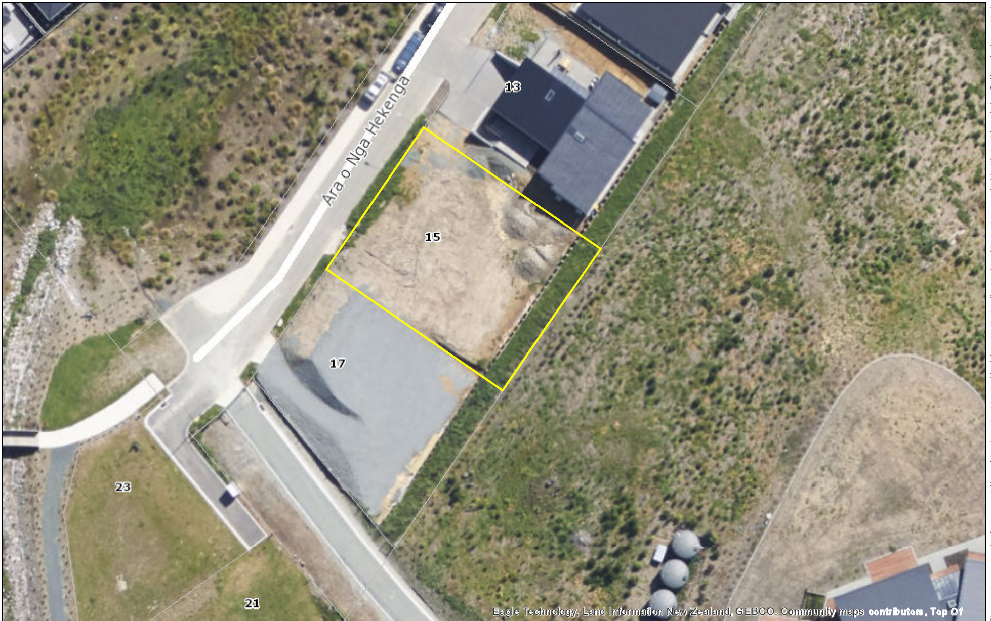
Eagle Technology, Land Information New Zealand, GEBCO, Community maps contributors, Top Of

The map is an approximate representation only and must not be used to determine the location or size of items shown, or to identify legal boundaries. To the extent permitted by law, the Tasman District Council and Nelson City Council, their employees, agents and contractors will not be liable for any costs, damages or loss suffered as a result of the data or plan, and no warranty or representation of any kind is given as to the accuracy or completeness of the information represented. Top of the South Maps information is licensed under a Creative Commons Attribution 3.0 New Zealand License, and the use of any data or plan or any information downloaded must be in accordance with the terms of that licence. Cadastrial and NZTopo50 related data is sourced from Land Information New Zealand