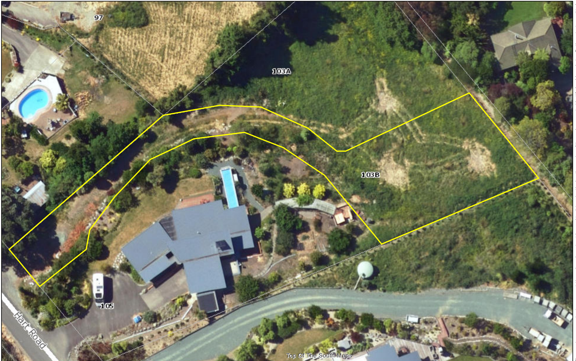
Top Of The South Maps