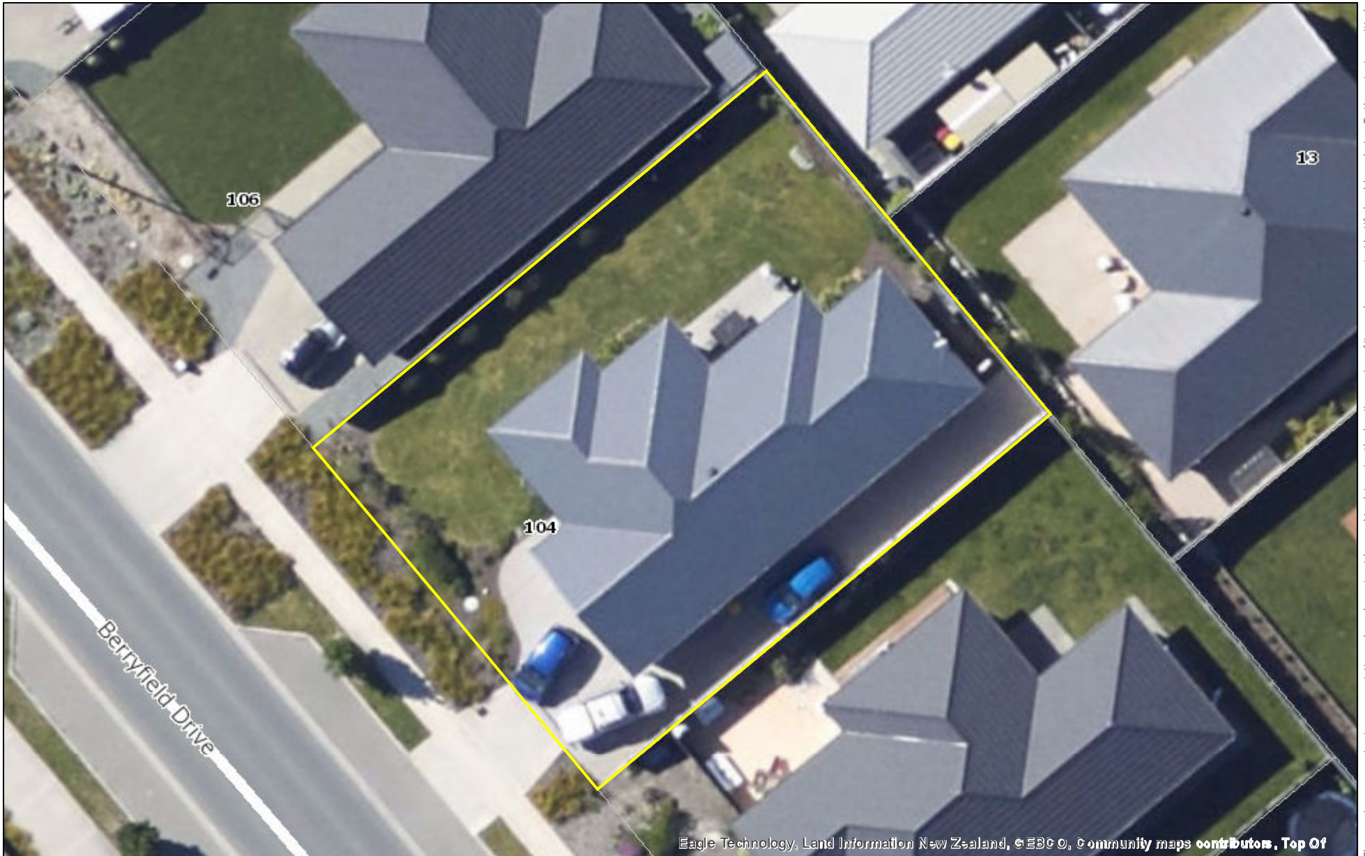
Eagle Technology, Land Information New Zealand, © EBCO, Community maps contributors, Top Of

The map is an approximate representation only and must not be used to determine the location or size of items shown, or to identify legal boundaries. To the extent permitted by law, the Tasman District Council and Nelson City Council, their employees, agents and contractors will not be liable for any costs, damages or loss suffered as a result of the data or plan, and no warranty or representation of any kind is given as to the accuracy or completeness of the information represented. Top of the South Maps information is licensed under a Creative Commons Attribution 3.0 New Zealand License, and the use of any data or plan or any information downloaded must be in accordance with the terms of that licence. Cadastral and NZTopo50 related data is sourced from Land Information New Zealand