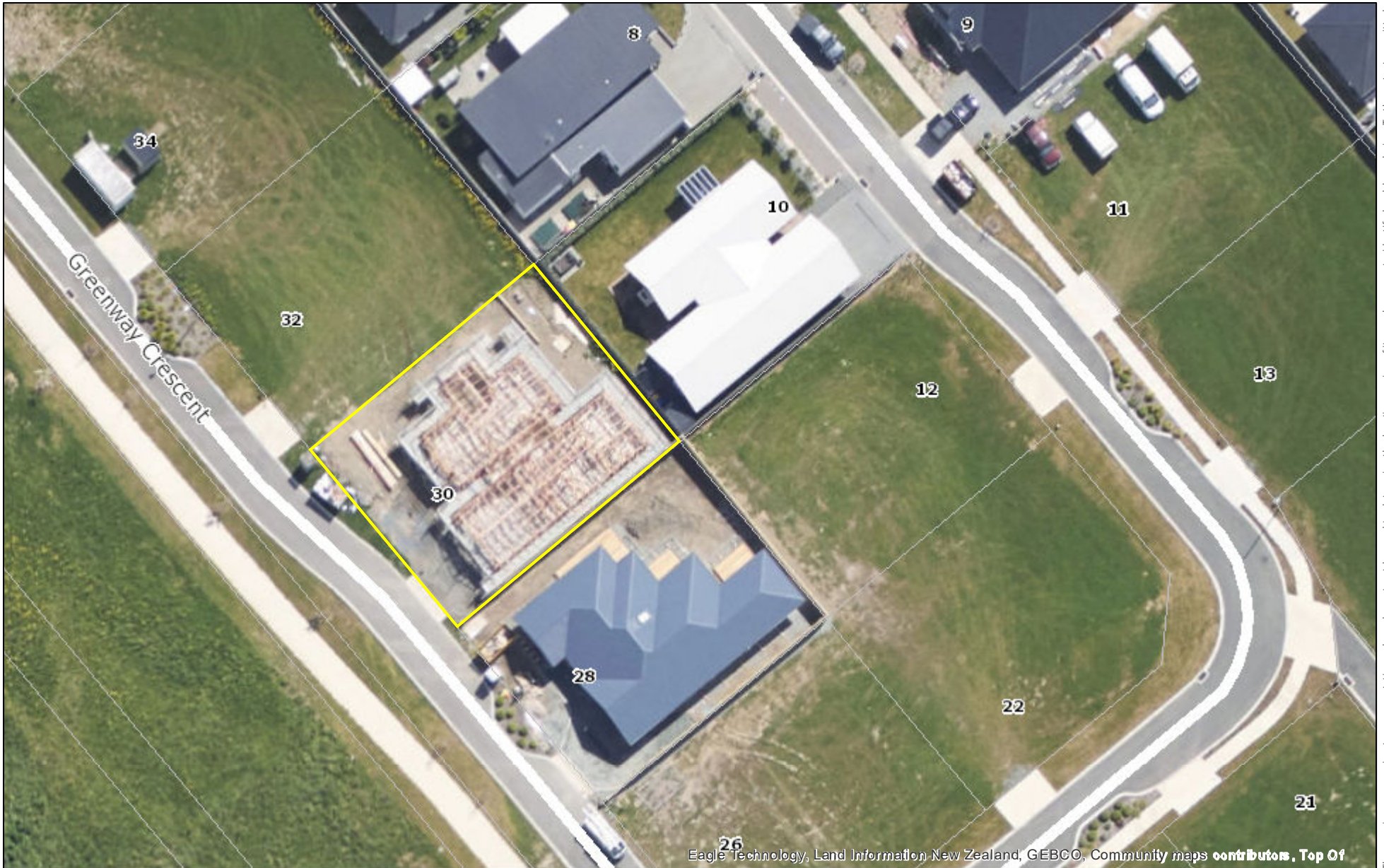
Eagle Technology, Land Information New Zealand, GEBCO, Community maps contributors, Top Of

The map is an approximate representation only and must not be used to determine the location or size of items shown, or to identify legal boundaries. To the extent permitted by law, the Tasman District Council and Nelson City Council, their employees, agents and contractors will not be liable for any costs, damages or loss suffered as a result of the data or plan, and no warranty or representation of any kind is given as to the accuracy or completeness of the information represented. Top of the South Maps information is licensed under a Creative Commons Attribution 3.0 New Zealand License, and the use of any data or plan or any information downloaded must be in accordance with the terms of that licence. Cadastrial and NZTopo50 related data is sourced from Land Information New Zealand