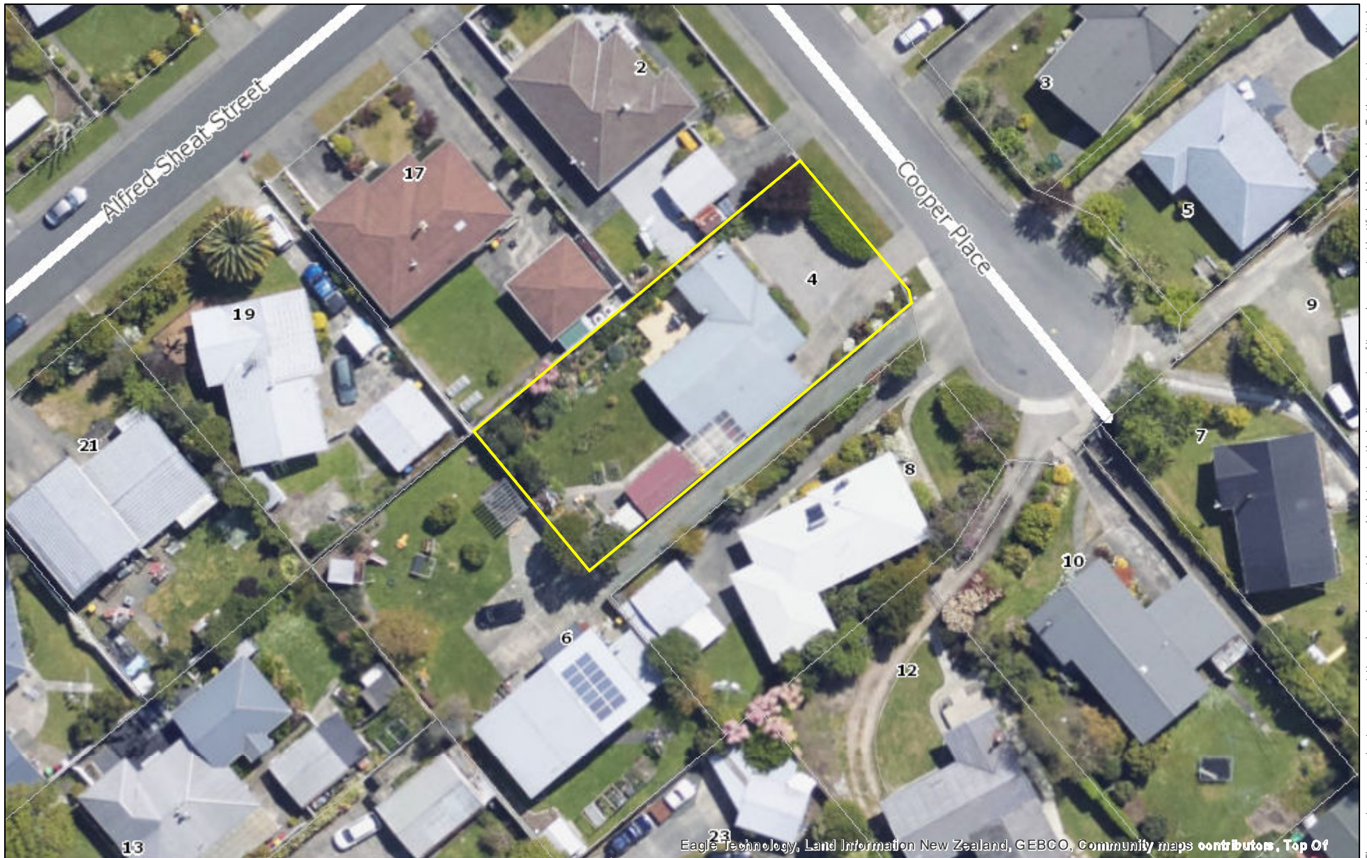
Eagle Technology, Land Information New Zealand, GEBCO, Community maps contributors, Top Of

The map is an approximate representation only and must not be used to determine the location or size of items shown, or to identify legal boundaries. To the extent permitted by law, the Tasman District Council and Nelson City Council, their employees, agents and contractors will not be liable for any costs, damages or loss suffered as a result of the data or plan, and no warranty or representation of any kind is given as to the accuracy or completeness of the information represented. Top of the South Maps information is licensed under a Creative Commons Attribution 3.0 New Zealand License, and the use of any data or plan or any information downloaded must be in accordance with the terms of that licence. Cadastrial and NZTopo50 related data is sourced from Land Information New Zealand