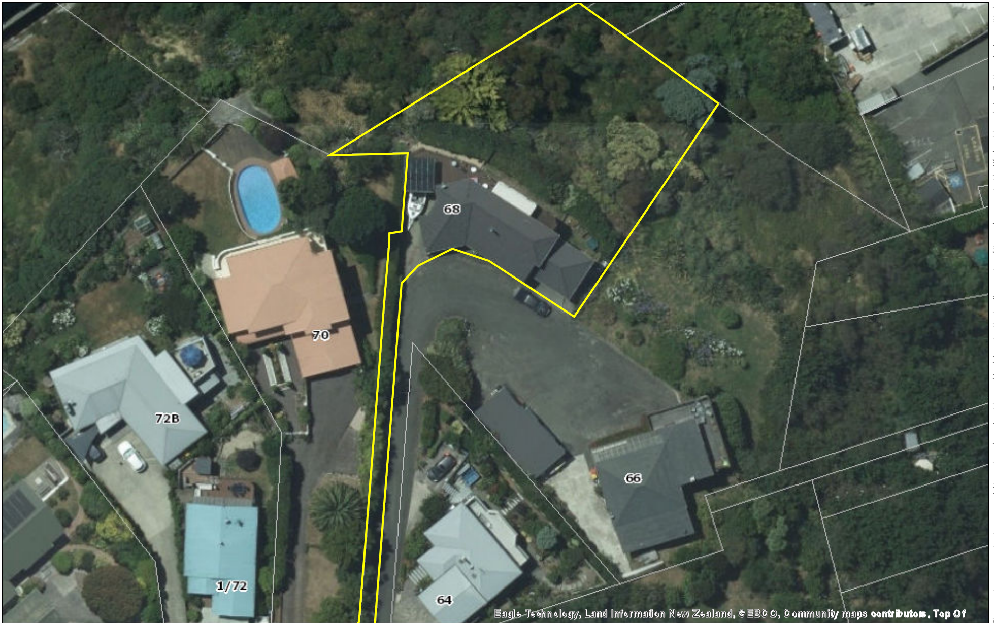
Eagle Technology, Land Information New Zealand, © EBCO, Community maps contributors, Top Of

The map is an approximate representation only and must not be used to determine the location or size of items shown, or to identify legal boundaries. To the extent permitted by law, the Tasman District Council and Nelson City Council, their employees, agents and contractors will not be liable for any costs, damages or loss suffered as a result of the data or plan, and no warranty or representation of any kind is given as to the accuracy or completeness of the information represented. Top of the South Maps information is licensed under a Creative Commons Attribution 3.0 New Zealand License, and the use of any data or plan or any information downloaded must be in accordance with the terms of that licence. Cadastral and NZTopo50 related data is sourced from Land Information New Zealand