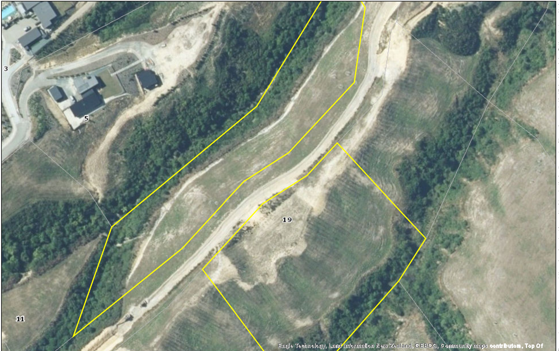
Eagle Technology, Land Information New Zealand, GEBCO, Community maps contributors, Top Of

The map is an approximate representation only and must not be used to determine the location or size of items shown, or to identify legal boundaries. To the extent permitted by law, the Tasman District Council and Nelson City Council, their employees, agents and contractors will not be liable for any costs, damages or loss suffered as a result of the data or plan, and no warranty or representation of any kind is given as to the accuracy or completeness of the information represented. Top of the South Maps information is licensed under a Creative Commons Attribution 3.0 New Zealand License, and the use of any data or plan or any information downloaded must be in accordance with the terms of that licence. Cadastrial and NZTopo50 related data is sourced from Land Information New Zealand