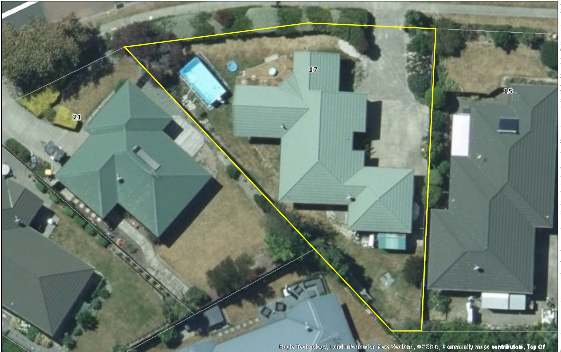
Eagle Technology, Land Information New Zealand, © EBC ©, Community maps contributors, Top Of

The map is an approximate representation only and must not be used to determine the location or size of items shown, or to identify legal boundaries. To the extent permitted by law, the Tasman District Council and Nelson City Council, their employees, agents and contractors will not be liable for any costs, damages or loss suffered as a result of the data or plan, and no warranty or representation of any kind is given as to the accuracy or completeness of the information represented. Top of the South Maps information is licensed under a Creative Commons Attribution 3.0 New Zealand License, and the use of any data or plan or any information downloaded must be in accordance with the terms of that licence. Cadastrial and NZTopo50 related data is sourced from Land Information New Zealand