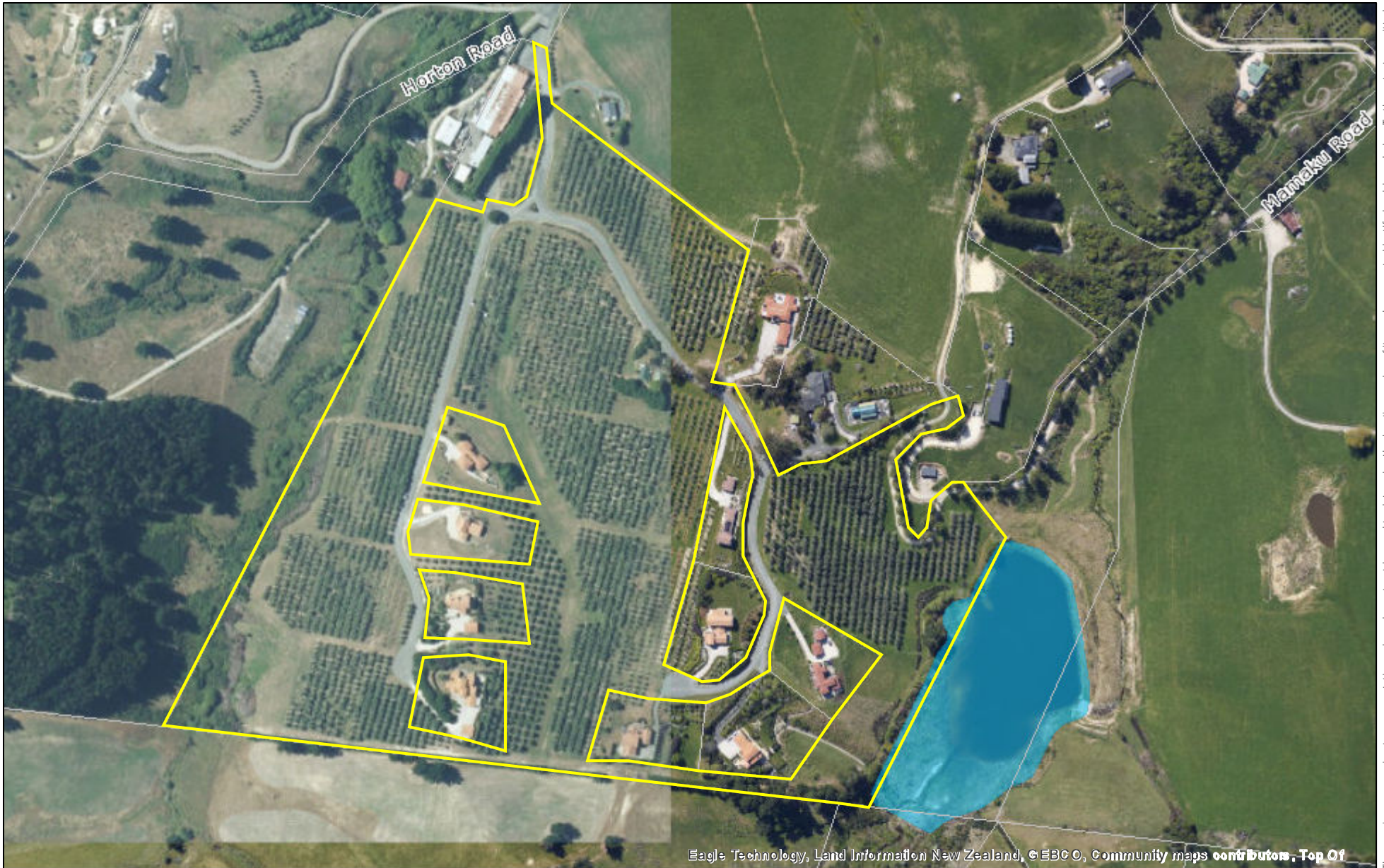
Eagle Technology, Land Information New Zealand, GEBCO, Community maps contributors, Top Of

The map is an approximate representation only and must not be used to determine the location or size of items shown, or to identify legal boundaries. To the extent permitted by law, the Tasman District Council and Nelson City Council, their employees, agents and contractors will not be liable for any costs, damages or loss suffered as a result of the data or plan, and no warranty or representation of any kind is given as to the accuracy or completeness of the information represented. Top of the South Maps information is licensed under a Creative Commons Attribution 3.0 New Zealand License, and the use of any data or plan or any information downloaded must be in accordance with the terms of that licence. Cadastral and NZTopo50 related data is sourced from Land Information New Zealand