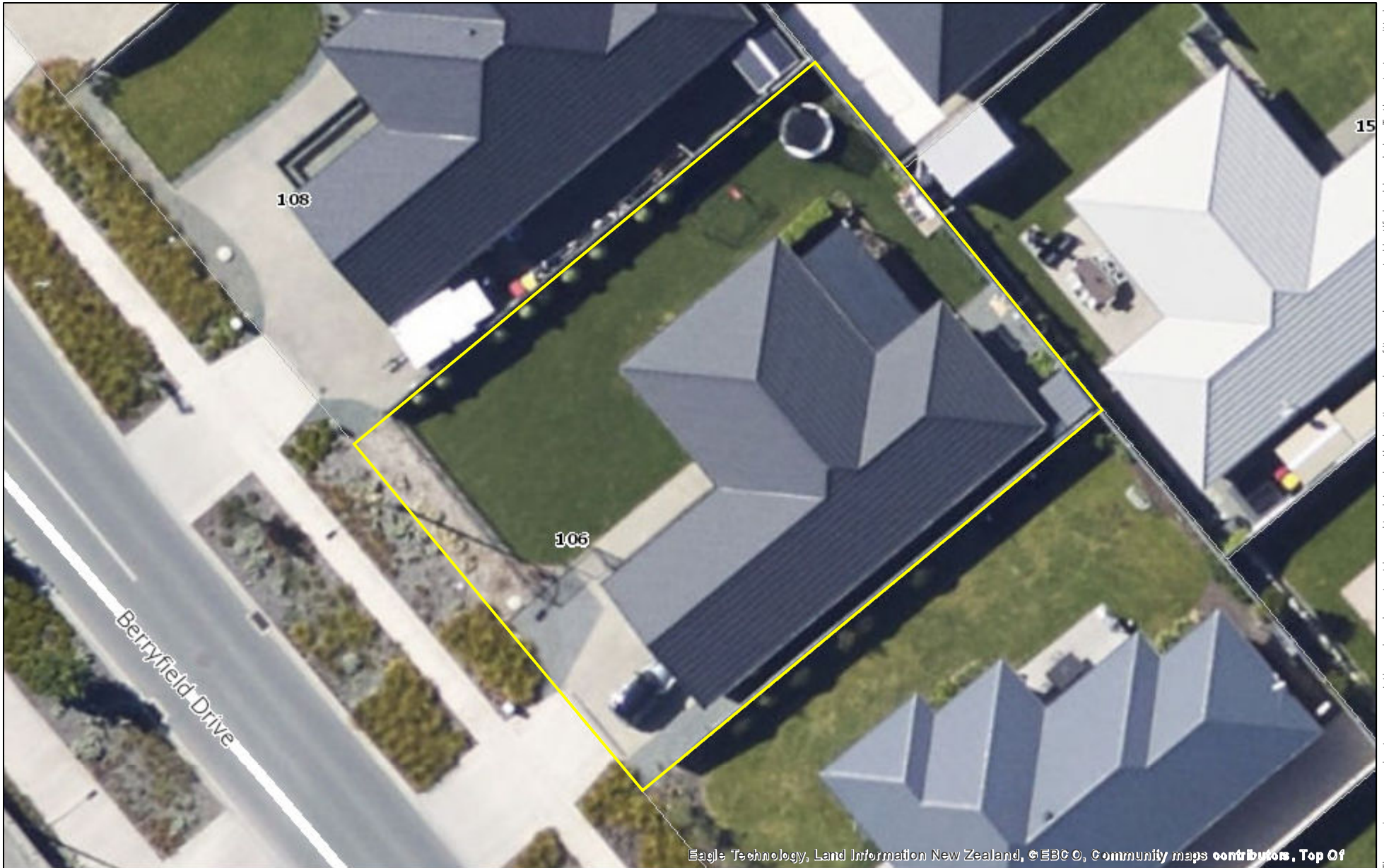
Eagle Technology, Land Information New Zealand, © EBCO, Community maps contributors, Top Of

The map is an approximate representation only and must not be used to determine the location or size of items shown, or to identify legal boundaries. To the extent permitted by law, the Tasman District Council and Nelson City Council, their employees, agents and contractors will not be liable for any costs, damages or loss suffered as a result of the data or plan, and no warranty or representation of any kind is given as to the accuracy or completeness of the information represented. Top of the South Maps information is licensed under a Creative Commons Attribution 3.0 New Zealand License, and the use of any data or plan or any information downloaded must be in accordance with the terms of that licence. Cadastral and NZTopo50 related data is sourced from Land Information New Zealand