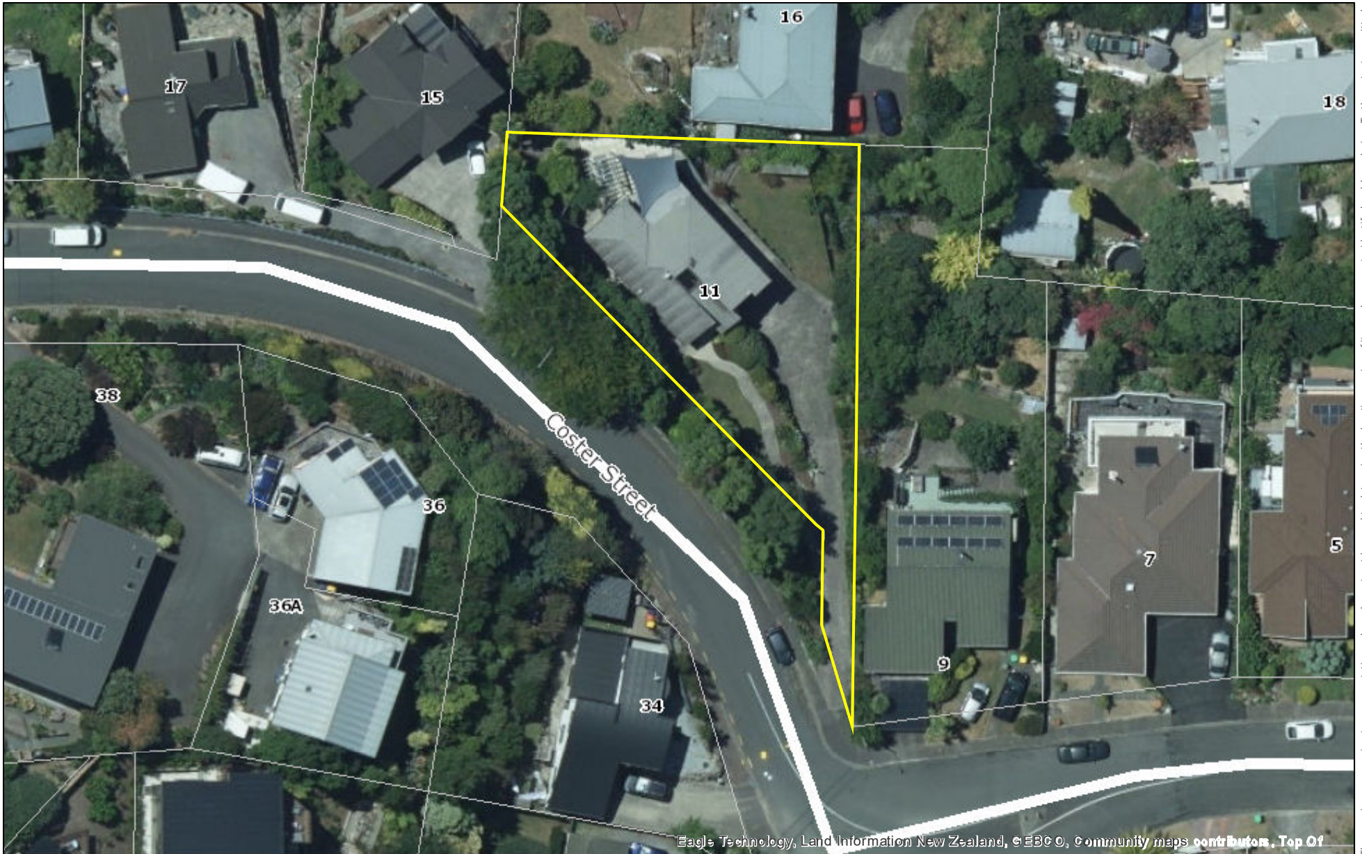
Eagle Technology, Land Information New Zealand, © EBCO, Community maps contributors, Top Of

The map is an approximate representation only and must not be used to determine the location or size of items shown, or to identify legal boundaries. To the extent permitted by law, the Tasman District Council and Nelson City Council, their employees, agents and contractors will not be liable for any costs, damages or loss suffered as a result of the data or plan, and no warranty or representation of any kind is given as to the accuracy or completeness of the information represented. Top of the South Maps information is licensed under a Creative Commons Attribution 3.0 New Zealand License, and the use of any data or plan or any information downloaded must be in accordance with the terms of that licence. Cadastrial and NZTopo50 related data is sourced from Land Information New Zealand