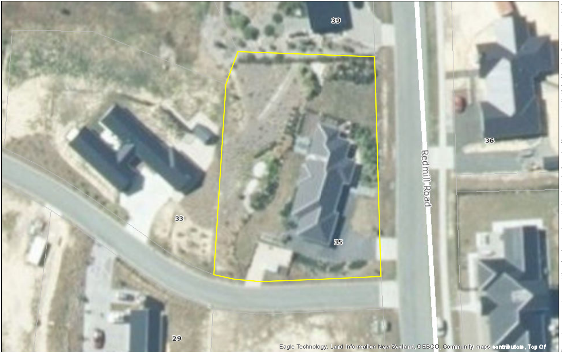
Eagle Technology, Land Information New Zealand, GEBCO, Community maps contributors, Top Of