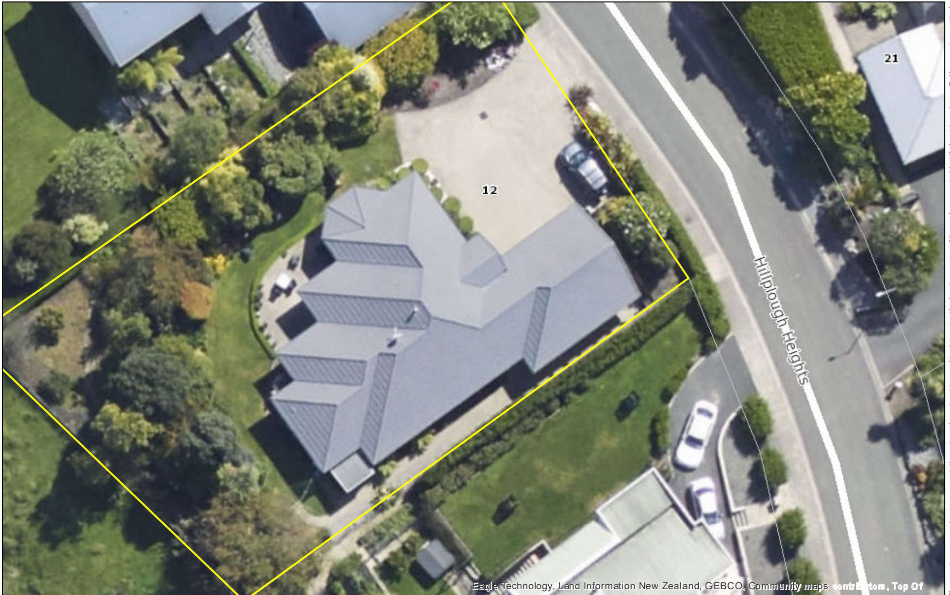
Google Technology, Land Information New Zealand, GEBCO, Community maps contributors, Top Of

The map is an approximate representation only and must not be used to determine the location or size of items shown, or to identify legal boundaries. To the extent permitted by law, the Tasman District Council and Nelson City Council, their employees, agents and contractors will not be liable for any costs, damages or loss suffered as a result of the data or plan, and no warranty or representation of any kind is given as to the accuracy or completeness of the information represented. Top of the South Maps information is licensed under a Creative Commons Attribution 3.0 New Zealand License, and the use of any data or plan or any information downloaded must be in accordance with the terms of that licence. Cadastrial and NZTopo50 related data is sourced from Land Information New Zealand