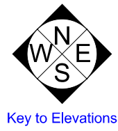
Key to Elevations