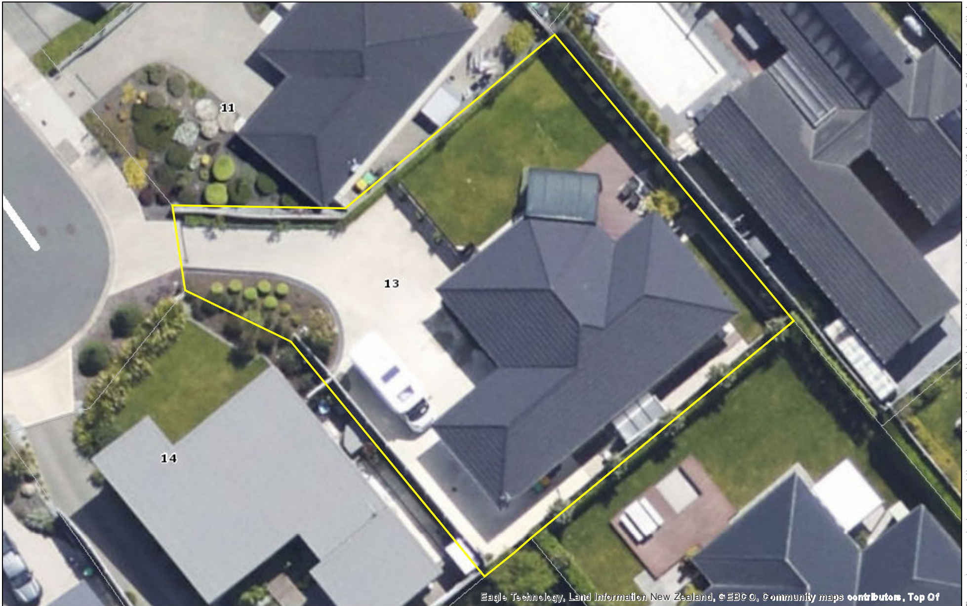
Eagle Technology, Land Information New Zealand, GBCO, Community maps contributors, Top Of

The map is an approximate representation only and must not be used to determine the location or size of items shown, or to identify legal boundaries. To the extent permitted by law, the Tasman District Council and Nelson City Council, their employees, agents and contractors will not be liable for any costs, damages or loss suffered as a result of the data or plan, and no warranty or representation of any kind is given as to the accuracy or completeness of the information represented. Top of the South Maps information is licensed under a Creative Commons Attribution 3.0 New Zealand License, and the use of any data or plan or any information downloaded must be in accordance with the terms of that licence. Cadastrial and NZTopo50 related data is sourced from Land Information New Zealand