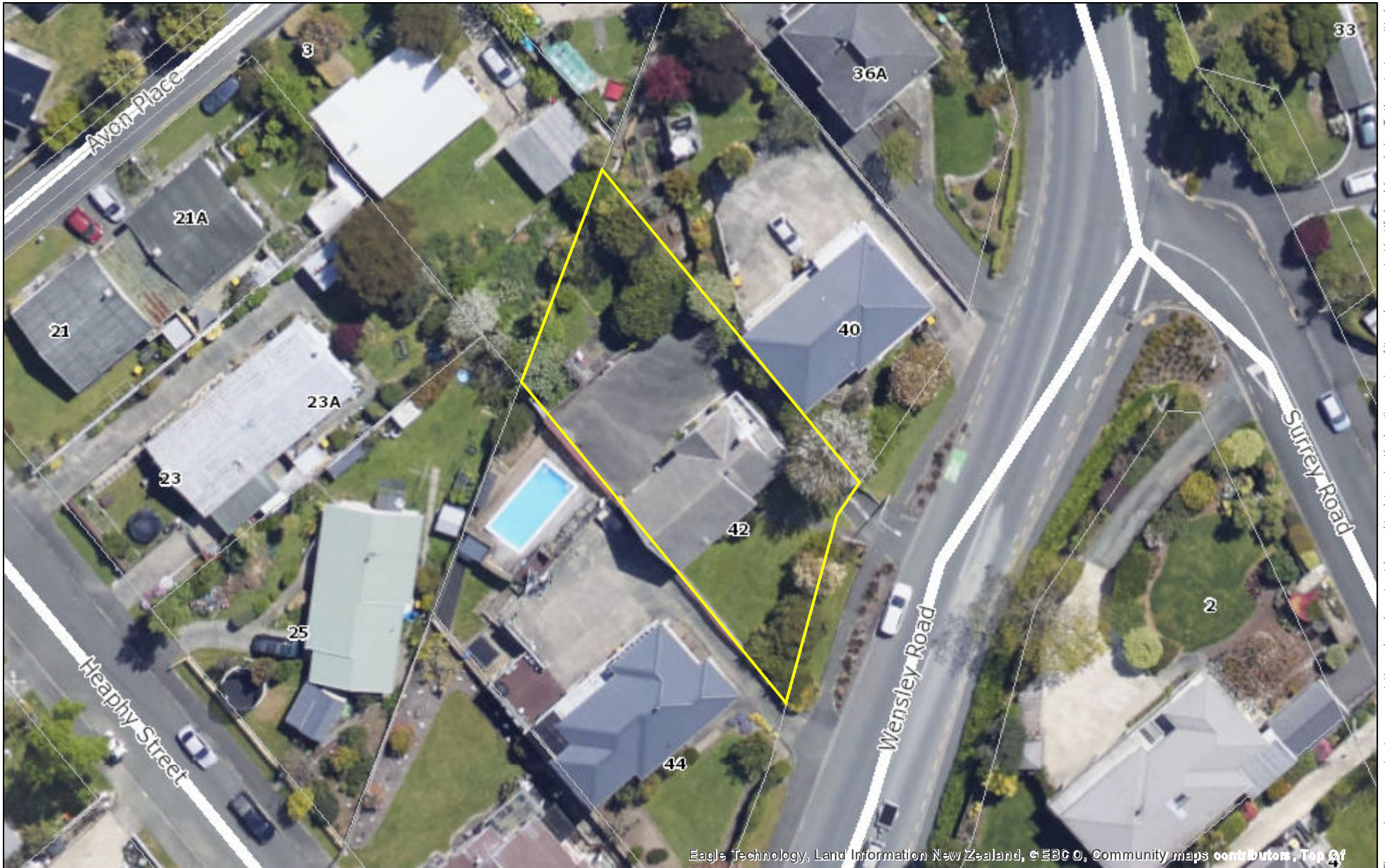
Eagle Technology, Land Information New Zealand, © EBC ©, Community maps contributors, Top of

The map is an approximate representation only and must not be used to determine the location or size of items shown, or to identify legal boundaries. To the extent permitted by law, the Tasman District Council and Nelson City Council, their employees, agents and contractors will not be liable for any costs, damages or loss suffered as a result of the data or plan, and no warranty or representation of any kind is given as to the accuracy or completeness of the information represented. Top of the South Maps information is licensed under a Creative Commons Attribution 3.0 New Zealand License, and the use of any data or plan or any information downloaded must be in accordance with the terms of that licence. Cadastrial and NZTopo50 related data is sourced from Land Information New Zealand