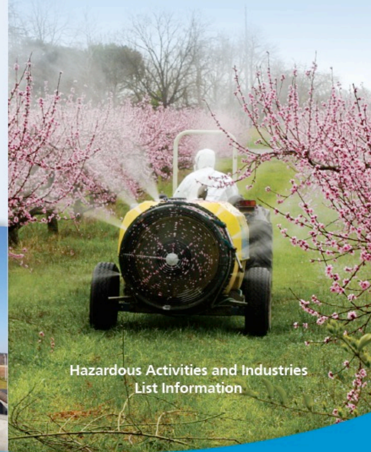
Hazardous Activities and Industries List Information