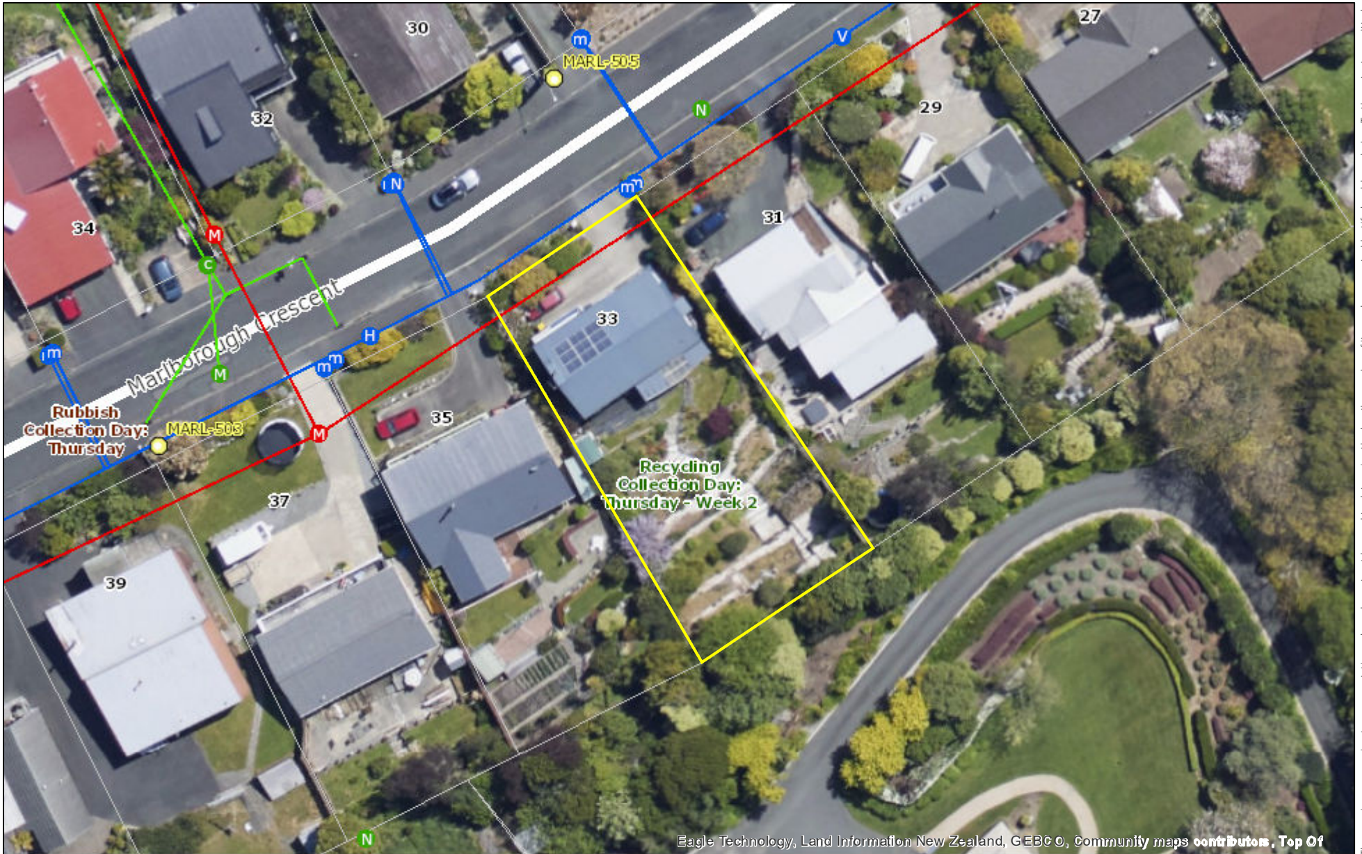
Eagle Technology, Land Information New Zealand, GEBCO, Community maps contributors, Top Of