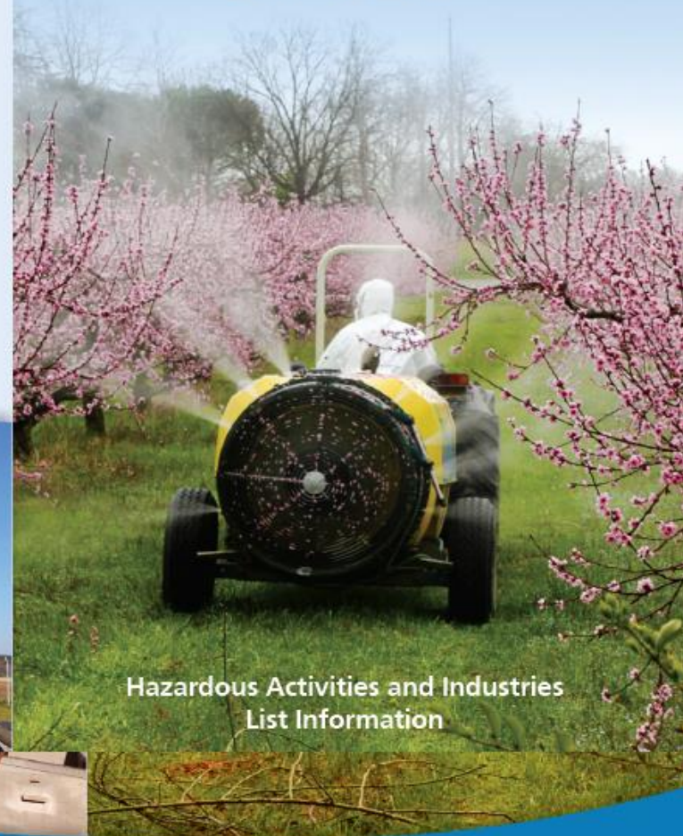
Hazardous Activities and Industries List Information