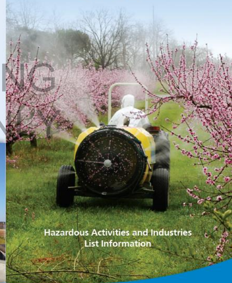
Hazardous Activities and Industries List Information