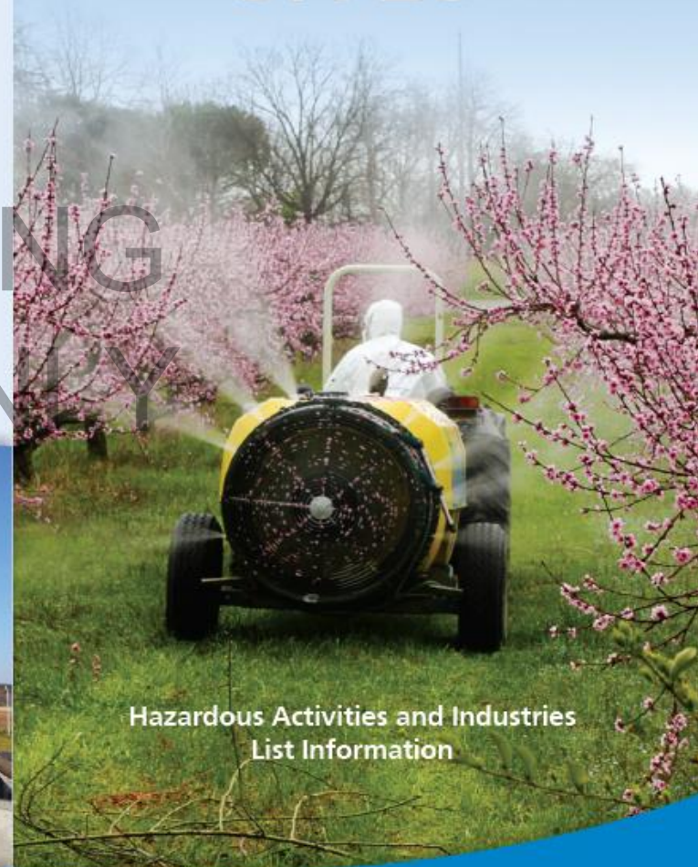
Hazardous Activities and Industries List Information